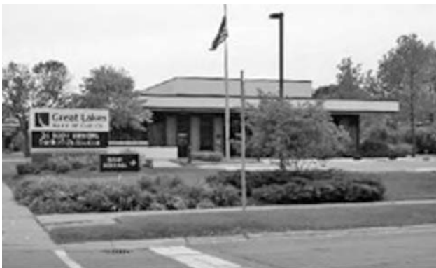
18600 Dixie Highway • 708-503-0400

If you make the Most High your dwelling— even the LORD who is my refuge— then no harm will befall you, no disaster will come near your tent.