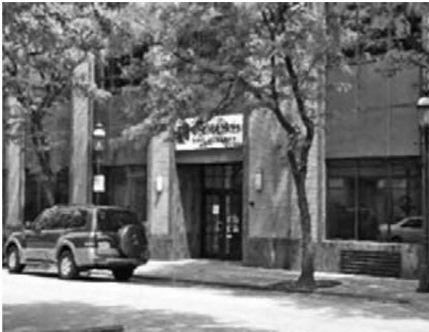
2034 Ridge Road • 708-503-0400

Proudly serving Homewood from two locations